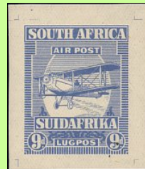
9d Proof in Blue