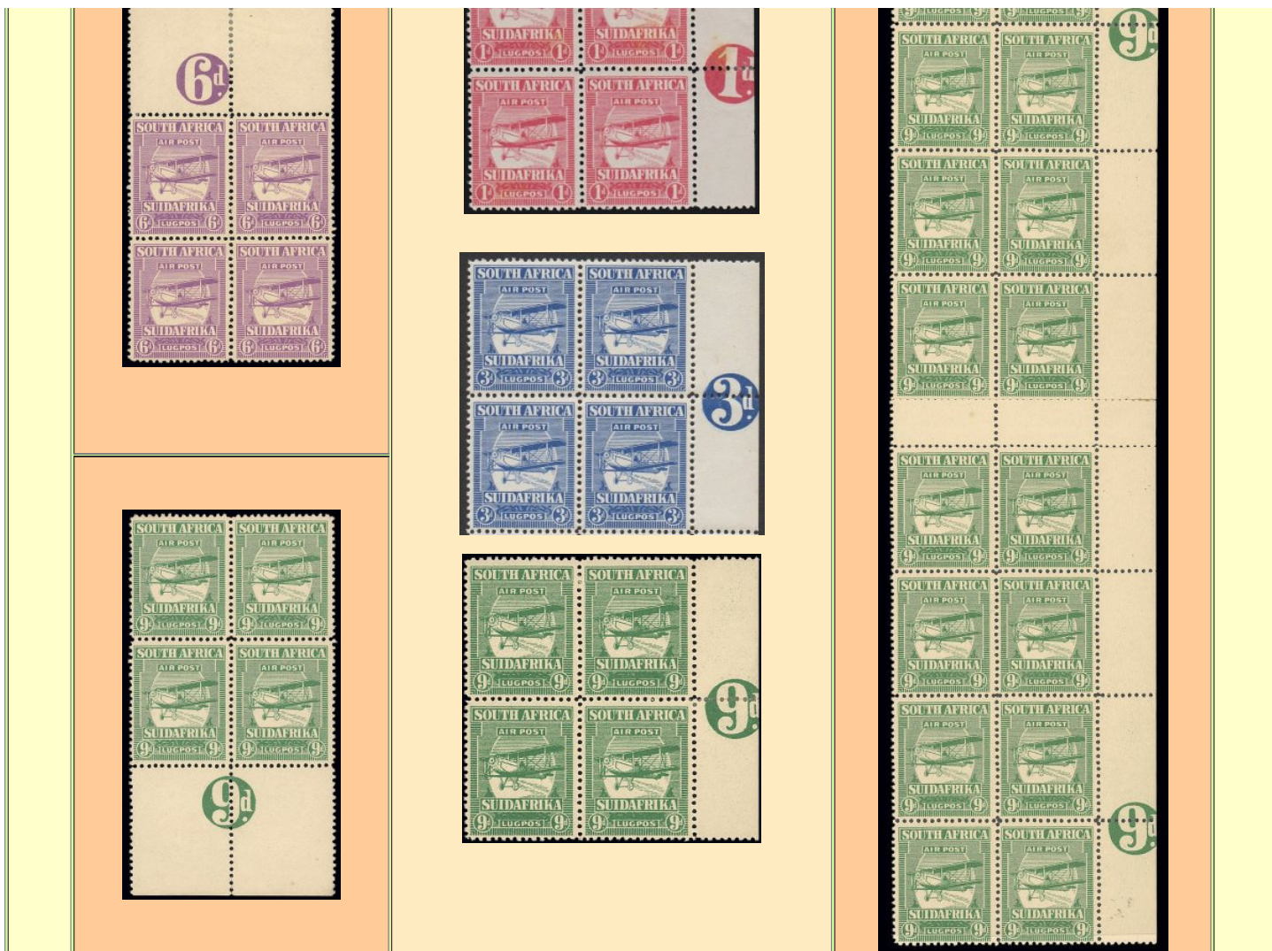
Value Tablets in Top, Bottom and Right hand Margins Ex Bloom Collection