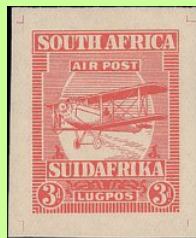
3d Proof in Red