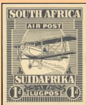
1d Proof in Black