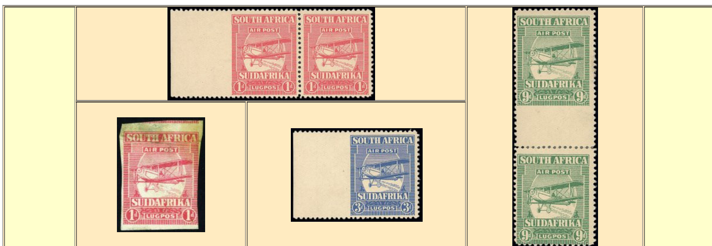
Varities 1d Pair and 3d Imperfate to Left Margin - 9d Vertical Pair Imperfate at Foot to gutter 1d Single Imperfate ex waste sheet of twelve