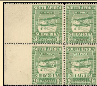
9d Imperforate on left Margin