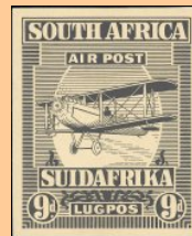
9d Proof in Black