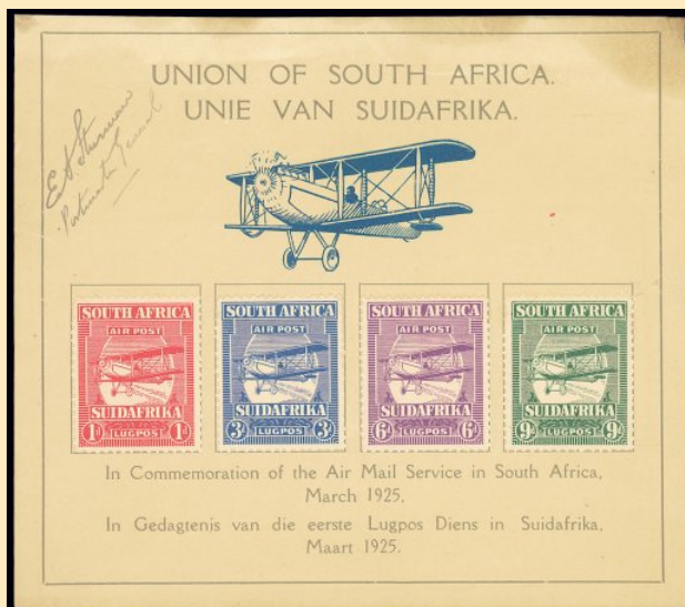
Official Souvenir Card Signed by P.M.G.