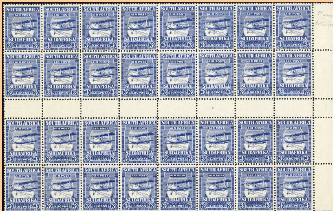
Courtesy - Murray Payne Auction 14 - Lot 421 3d Block of 32 with Interpanneau gutter