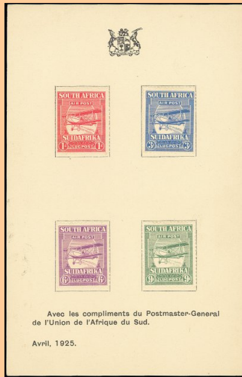
U.P.U. Official Souvenir Card